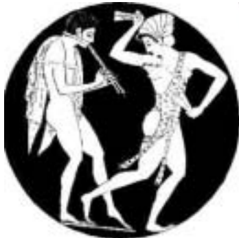
Ancient Greeks Dancing

A rocking melody played on instruments and Intel chips. Of course there would be loopy laser lighting to liven your languid lignin (look it up). Unfortunately, the PCDC corporate jet is being refitted, after that bit of unpleasantness with the wing falling off. So we're not going to Cupertino. Let them come to us. We'll do a techno contra right here in Portland. How about Saturday, March 30th? You available?