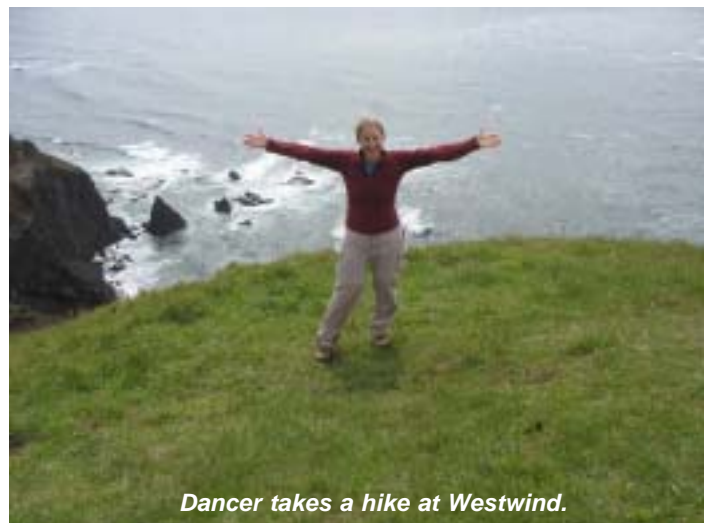
Dancer takes a hike at Westwind.